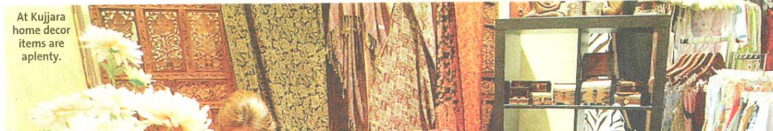
At Kujara home decor items are aplenty.