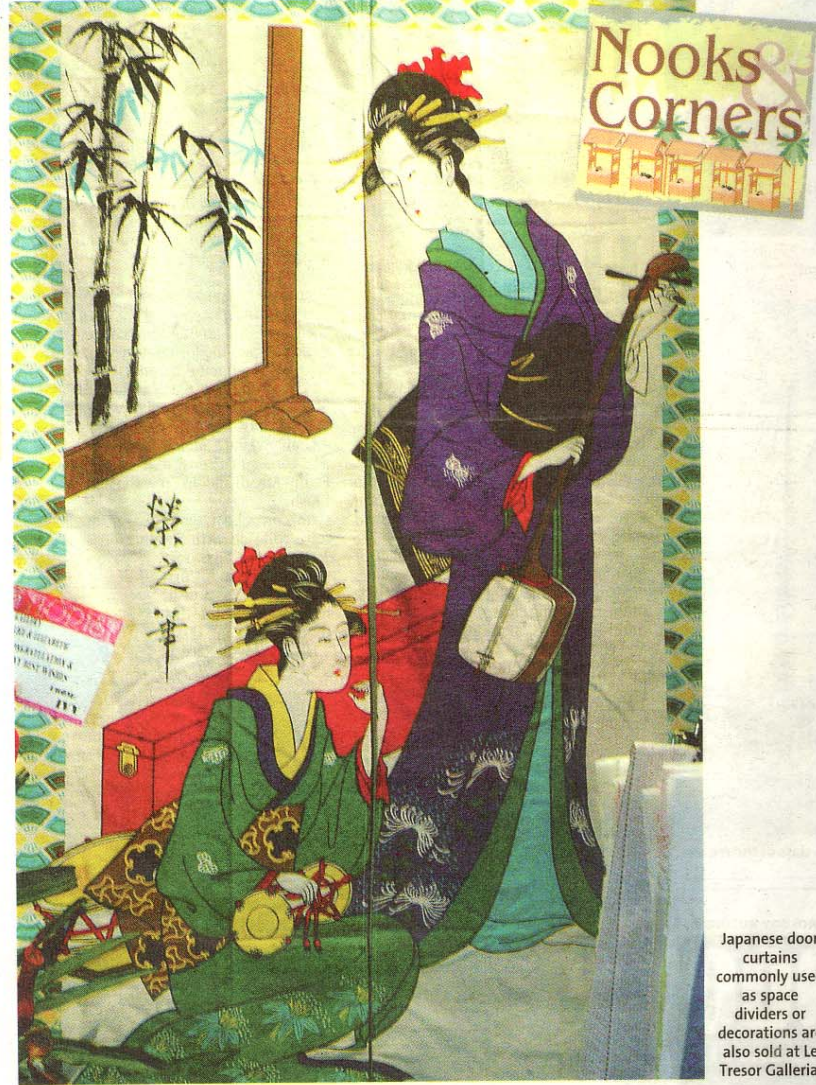
Japanese door curtains commonly used as space dividers or decorations are also sold at Le Tresor Galleria.

■ LE TRESOR GALLERIA is located at S12, 2nd Floor, Lot 10 shopping centre. For details, call 03-2142 4006.