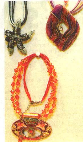
The Cana collection offers interesting jewellery at affordable prices.

Over at Nen's Belles you can find fashionable clothes, bags and accessories ranging from casual to