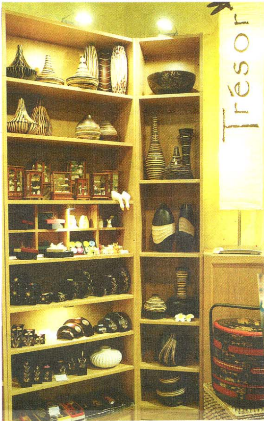
More home décor items at Tresor.